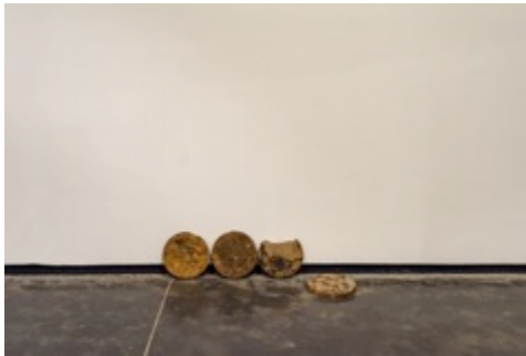
Hemali Bhuta, Copy (2016) Bees wax, termite infested wax, paraffin wax, soap, adhesive, incense powder 8.5 x 0.5, 8 x 0.5, 8 x 1 inch