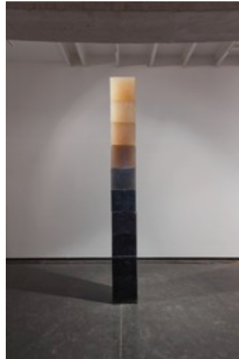
Hemali Bhuta, Grayscale (2012) Glycerine soap, edible colour, S.S. rod and S.S. plate 12 inches cube x 10 nos