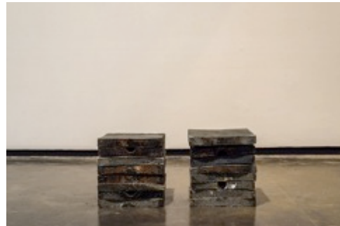
Hemali Bhuta, 16 sq. ft (2016) Glycerine soap, edible colour, and nylon thread 10 x 11 x 12 inches Courtesy of the artist and Project 88, Bombay