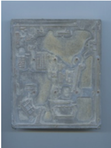
Hemali Bhuta, Layout for Project 88 (2016), Engraved zinc sheet on wood, 32 x 38 inches